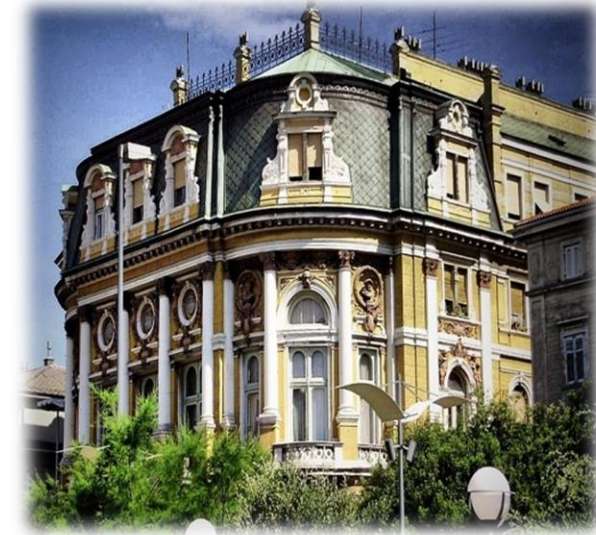
Palazzo Modello Seat of the IU Fiume-Rijeka (Cro)