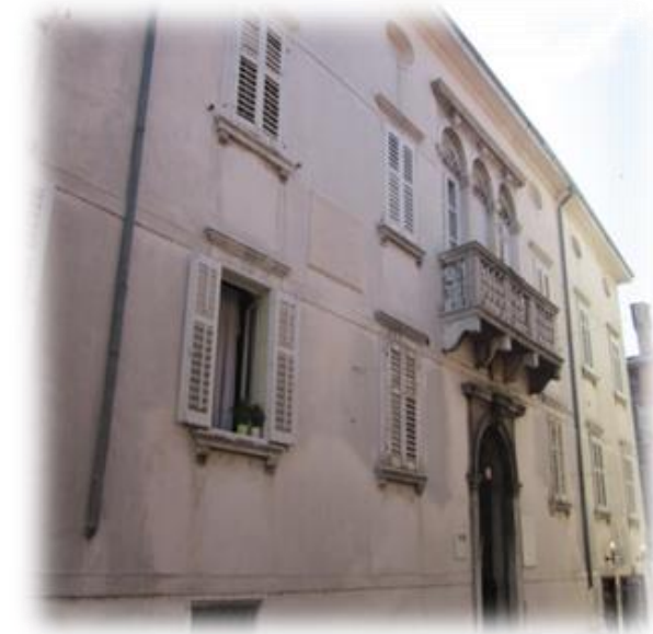
Palazzo Carli Seat of the IU Capodistria - Koper